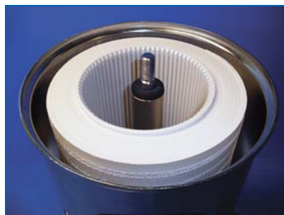
Figure 1: The SUPRApak S filtration assembly consists of one module and the housing.