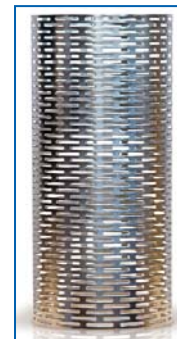
Figure 4: Stainless steel core for hot fluid filtration

8 Required for continuous hot fluid filtration (> 40 °C / > 104 °F). See Figure 4.