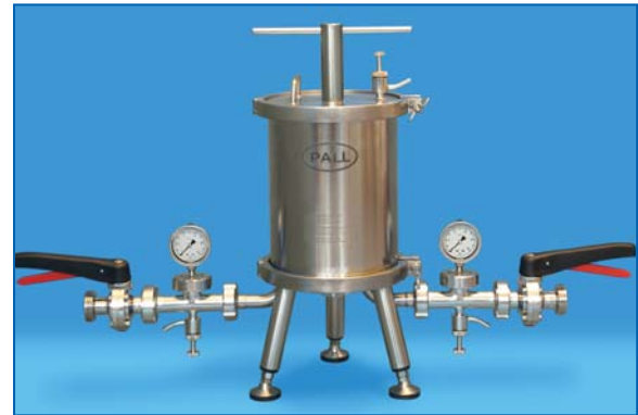
Figure 3: SUPRApak housing SPSSANW250D

7 The standard accessory package is only available with DN 25 DIN 11851 connections and includes diaphragm pressure gauges (2) and butterfly valves (2) for the feed and filtrate sides of the housing.