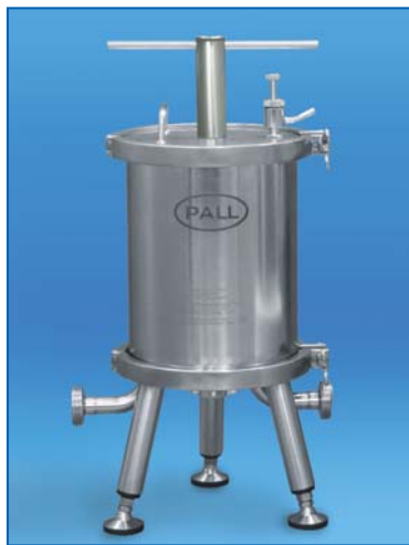
Figure 2: SUPRApak housing SPSWANW2500